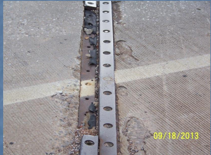
Armoring needs to be replaced