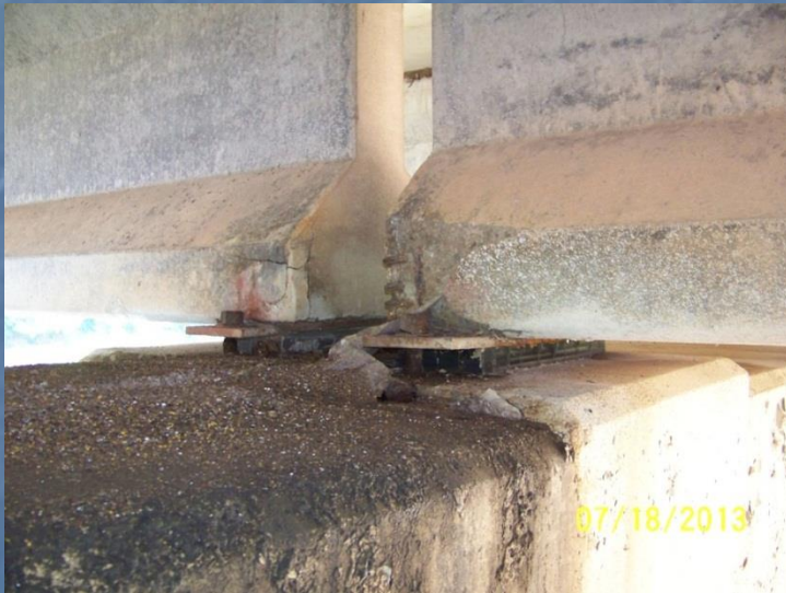
Only one bay is leaking

Bridges built in 80's, small portion of expansion joint leaking, NBI ratings for deck, superstructure, and substructure are still 7 or more which is considered to be good condition