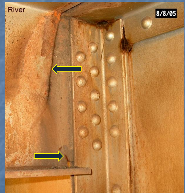
Metal fatigue cracks due to square coping